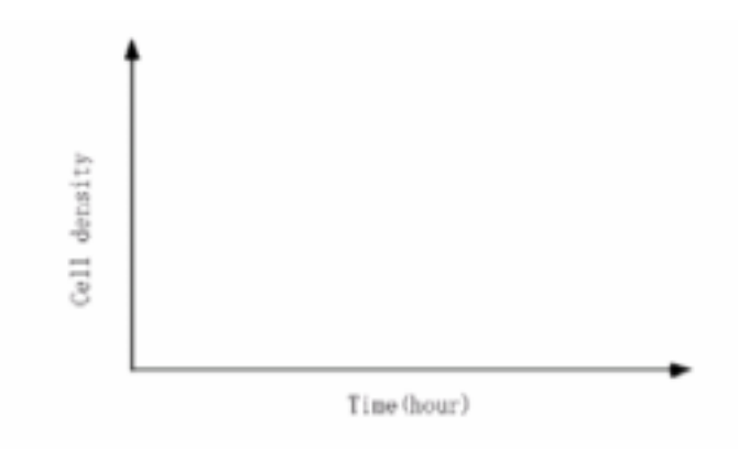
Figure example 1 Algal growth curve

Attach 1) a growth curve (Figure example 1) and 2) a figure showing the growth inhibition rates at individual test concentrations (Figure example 2) during the exposure period.